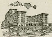
THE FINEST ALL-YEAR HOTEL IN THE SOUTH