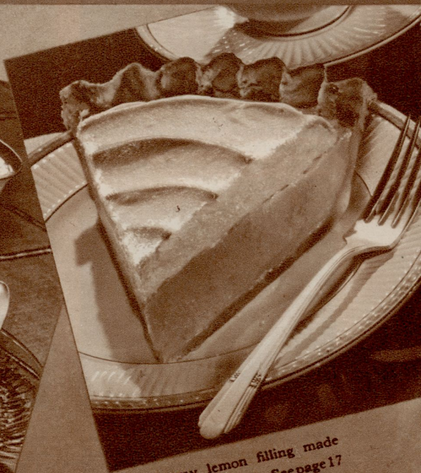
Creamy lemon filling made without cooking! ... See page 17