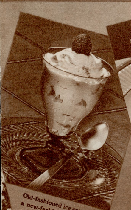
Old-fashioned ice cream made a new-fashioned way! ... See page 4